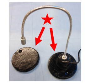
Use LED light, Magnifier, or Multi-Device Flex arm on any bench by attaching to <u>steel base</u>